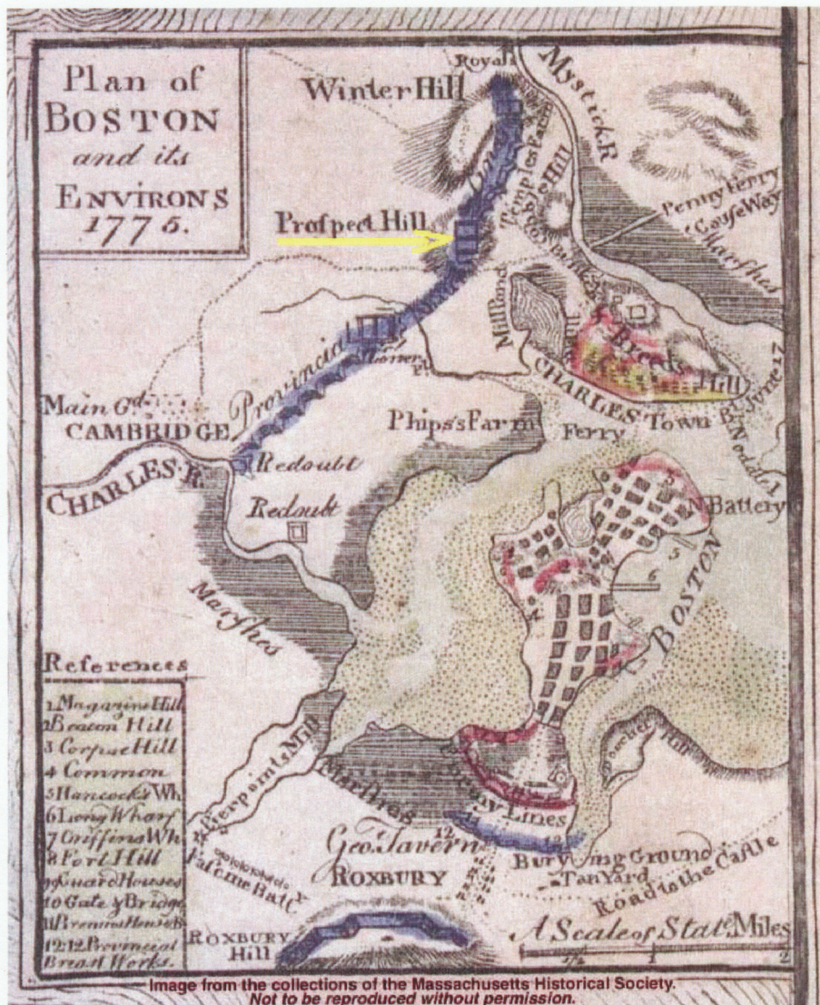
"Plan of Boston and its Environs 1775." Detail from Map of the Seat of Civil War in America . Engraving by Bernard Romans. Philadelphia: 1775. American lines in blue, British lines in red.